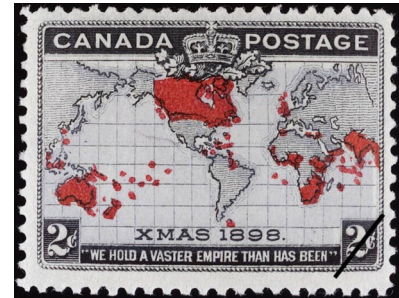
The first Christmas stamp.